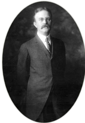
Oswald Garrison Villard, c. 1910.