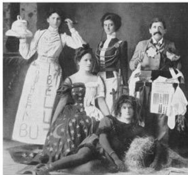
Prize winners for most original costumes at the 1901 Grand Purim Masquerade Ball were featured on the following year's invitation to the annual event, sponsored by the Hebrew Benevolent Society of Orangeburg, South Carolina. Author Julia Peterkin, second from left, won the Pulitzer Prize in 1928 for her novel Scarlet Sister Mary.