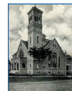
Temple B'nai Israel, 1897