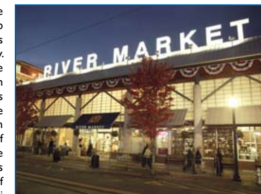
River Market, Little Rock

Today, Little Rock is the hub of the state's Jewish activity. The Little Rock Jewish Federation has evolved into the statewide Jewish Federation of Arkansas. Little Rock supports chapters of Hadassah, B'nai B'rith, and Jewish War Veterans as well as the Ati' (Our Future) Day School. In 1992 Lubavitch Hasidim opened a Chabad House. One popular event is the annual Jewish Food Festival, which draws as many as 10,000 to the downtown River Market Pavilions.