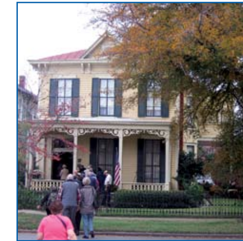
SJHS arrives at 1874 Pollock House