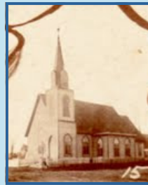
Synagogue of the United Hebrew Congregation, Gainesville, TX. Constructed 1885. After the congregation dissolved in 1922, the building was used by a Protestant congregation.

When Stuart Rockoff arrived in Gainesville, Texas, to conduct research for the ISJL's online Southern Jewish Encyclopedia, a stranger was waiting for him at the city's Morton Museum. The gent introduced himself as the last local descendant of Gainesville's United Hebrew Congregation, which dissolved in 1922. What's more, the man had in hand the congregation's last minute book. It covers meetings from May of 1905 to Nov. 5, 1922, when the congregation finalized the sale of its handsome building for $1,000, payable over a four-year period at 7% interest.