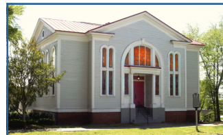
The Big Apple. Within the walls of this circa-1915 former synagogue-turned-black-nightclub was born the dance craze that swept the nation during the summer of 1937. Today, the Big Apple ranks as one of Columbia's favorite locations for weddings, parties, luncheons, meetings and special events.

Reserve your hotel room now. A special conference rate is available. The Inn at USC: 1619 Pendleton Street, Columbia, SC. Phone 803.779.7779 Mention SJHS / JHSSC. Room Rates: $115.00 /night plus tax, includes breakfast, parking, & free internet. Reservations must be made directly to the hotel. Prices valid until 27 September 2011